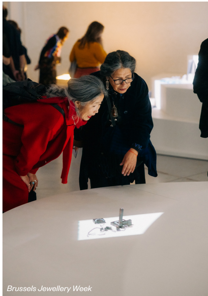
Brussels Jewellery Week

Overall, 153 Brussels and Belgian designers were showcased through these exhibitions, attracting 8,918 visitors and generating 92 dedicated press features on these events.